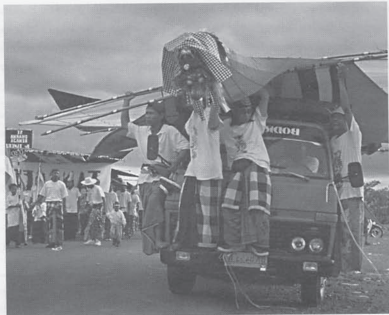
A village team heads for the festival with its giant kite.

Each participating banjar constructed a kite for this biennial festival, a big commitment of resources. To the cost of the huge kite itself would be added the cost of maintaining an orchestra to encourage the kite, matching tee-shirts for the handlers, transport by truck of the kite to the festival site, etc. The banjar is a basic feature of Balinese society, a kind of men's club with 250 to 300 members, that keeps alive local ceremonies and other traditional activities, including kite-