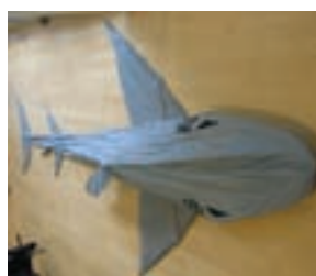
10 Shark 142" x 37" x 23" Martin Lester