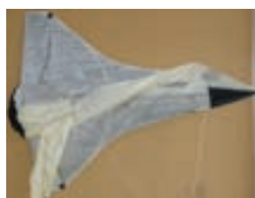
9 Space Shuttle 49" x 35" x 25" Martin Lester