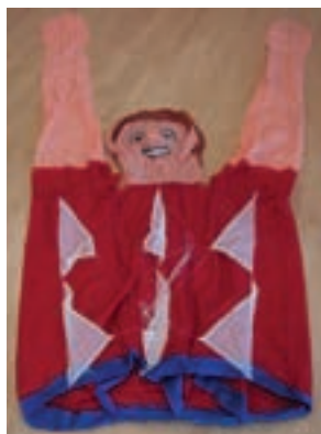
3 The Top Half 103" x 63" Martin Lester