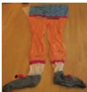
4 Soccer Legs 91" x 45" Martin Lester