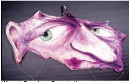
Kite at Drachen Foundation