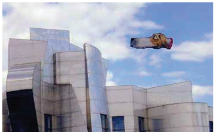
Dog in the Sky